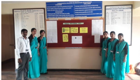
Poster Presentation by Youth Red Cross Wing Members