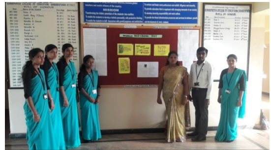
Poster Presentation by Youth Red Cross Wing Members

On 8 th May 2017, International Red Cross Day was organised by the Youth Red Cross Wing members of our college. In this occasion, the articles written and collected by our student teachers were displayed articles related to youth Red Cross Day theme and services rendered by the Youth red cross wing. Majority of student teachers took active participation in the programme. The articles are found meaningful in developing awareness about the youth services.