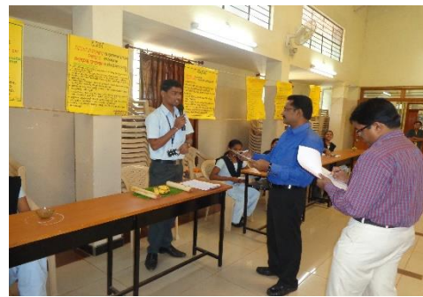
Judges involved in judgment

On 24 th December 2016, Youth Red Cross Wing of Kumadvathi College of Education has Organized “ Exhibition of Medicinal Plants and Food materials ” under the title “ Saysa sanjeevini ”. Student Teachers exhibited various kinds of medicinal plants and food material and explain their importance in our daily life. The Programme was found very meaningful. Principal, teaching, non-teaching staff and student teachers were present during the Exhibition.