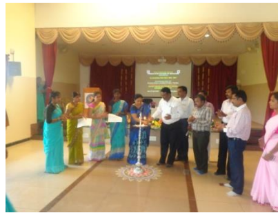
Youth Red Cross Wing inauguration by lighting the lamp