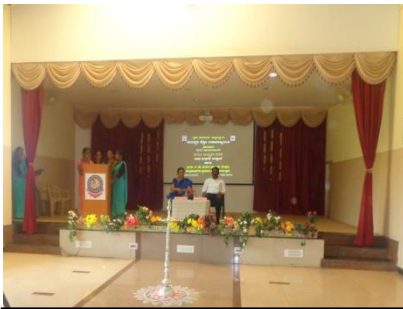
Invocation by the Student Teachers