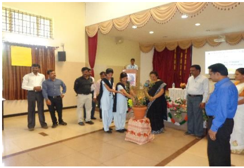
Inauguration of Exhibition