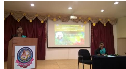
Student teachers sharing their opinions about the achievements of Sir M Viswesvaraya

On 15 th September 2017 on the eve of birthday of Sir M Viswesvaraya Engineer's Day was celebrated in the Kumadvathi College of Education by the science club members. On this occasion all the staff and student teachers were present. To commemorate the birthday of Sir M Viswesvaraya, science club members of Kumadvathi College of Education organised a Video clip presentation on "Early life & achievements of Sir M Viswesvaraya". All the staff and student teachers took active participation enthusiastically. Later science club members posed some questions to the audience based on the video presented and given prizes for right responses. The programme was found meaningful in awakening our student teacher regarding great achievements of sir M Viswesvaraya.