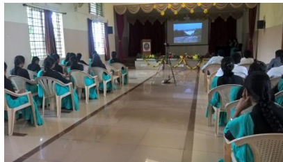
Student teachers watching video clips of early life & achievements Sir M Viswesvaraya