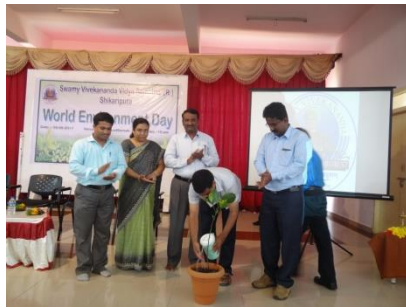
Guests inaugurating the programme by watering the plant