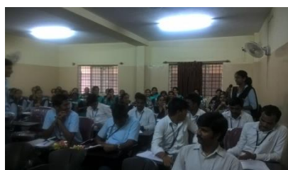
Participants involved in the discussion