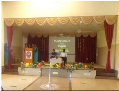
Invocation by the Student Teachers