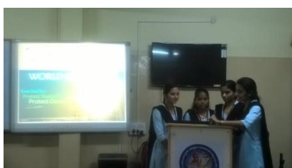
Invocation by the science club members

Topic : Role of public life in preventing ozone layer destruction