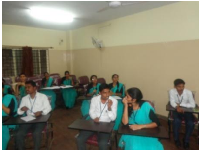
Student Teachers involved in Quiz competition