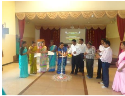
Science Club inauguration by lighting the lamp