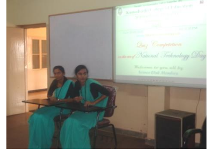
President and Chief guest of the programme observing the Quiz Competition

On eve of National Technology Day i.e. on 15 th May 2017 Quiz competition was organized for our Science Club Members on the topic “ Technology in 21 st Century ”.