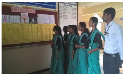
Student Teachers involved in reading the articles about Aids.

On eve of world AIDS Day, i.e on 1 st of December 2017, from Science Club of Kumadvathi College of Education Notice Board Display of various thought provoking articles about AIDS was organized. On this occasion all the science club members have displayed good number of articles related to History of AIDS, Causes for AIDS, Incidence of AIDS prevalence as well as preventive measures of AIDS. The programme was found meaningful, as it was read by all the student teachers and helped them in developing awareness about AIDS.