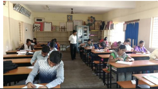
Student Teachers involved in Essay Writing

On eve of World Water Day i.e. on 1 st April 2017 essay competition was organized for our student teachers based on this year's world environment day theme i.e. “Conserve water: Save life” .