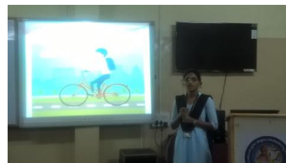
Science Club members involved in PPT presentation about Conservation of Ozone Layer

“There is no life zone without ozone” is one of the most commonly said and remembered slogan in the present scenario. On eve of World Ozone Day on 16th September 2016 a special programme of power point presentations on the topic “Ozone layer and its importance, Causes and effects of Ozone layer depletion & Role of public life in preventing ozone layer destruction” was organised by Science club members of Kumadvathi College of Education. On this occasion Principal, staff and all the student teachers were present.