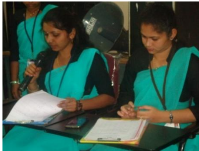
Student Teachers involved in Judgement