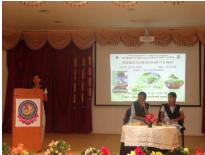
Student Teacher involved in Debate competition