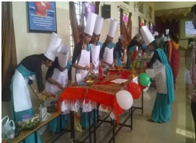
Participants Involving in the Competition