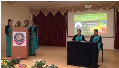
Invocation by Science Club members in the programme