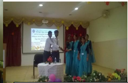
Winner of the Competition Receiving the Prize