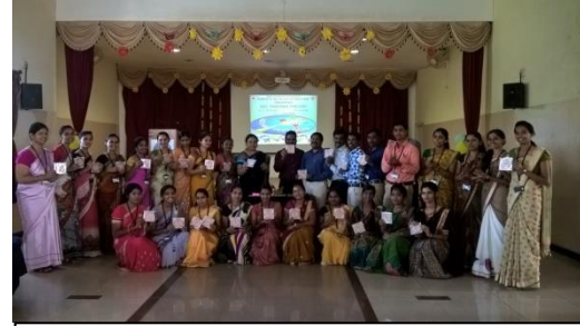
Patron, Mentors and Science club members Releasing the digital magazine