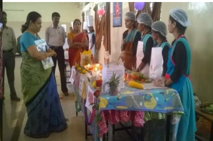
Participants Involving in the Competition