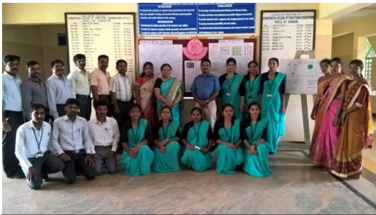
Poster Presentation by Science Club Members