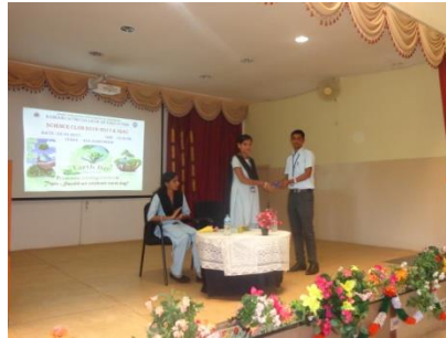
Student Teacher receiving the prize