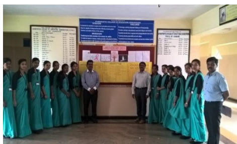
Science club members exhibiting the articles about Aids