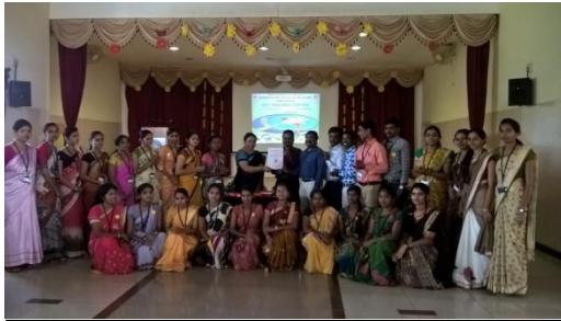
Patron, Mentors and Science club members Releasing the magazine