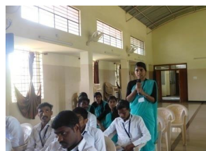
Student Teacher involved in the interaction programme