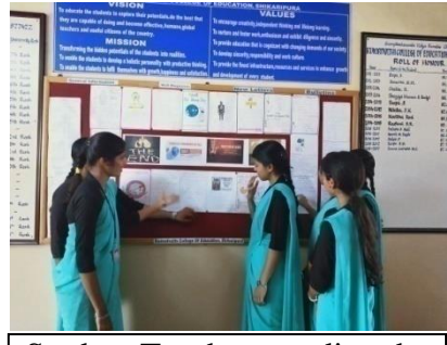
Student Teachers reading the articles