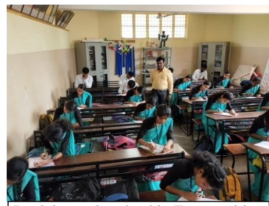
Participants involved in Essay writing

On eve of World Ozone Day i.e. on16<sup>th</sup> September 2019 essay competition was organized for our student teachers on the topic "Role of Public Life in conserving Ozone Layer".