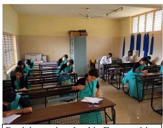
Participants involved in Essay writing