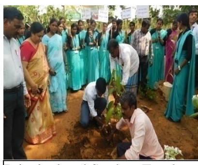
Principal and Student Teachers involved in plantation