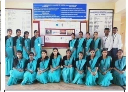
Student teachers representing their display of articles

On the eve of World No Tobacco Day On 31<sup>st</sup> May 2019, the science club members of Kumadvathi College of Education have displayed articleson various impacts of Tobacco intoxication on our body. All the science club members and mentors took active participation in the event.