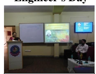
Presidential speech by Science Club Patron