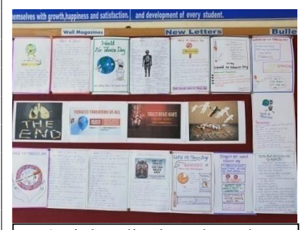
Articles displayed on the Notice board