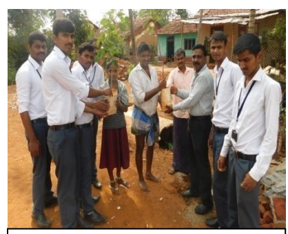
Faculty members and student teachers distributing the plants for publics

On 8<sup>th</sup> June 2019, science club members of kumadvathi college of education have organized the environmental awareness and plantation programme at Anjanapura circle, Shikaripura taluk.