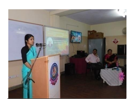
Science Club members welcoming the guests