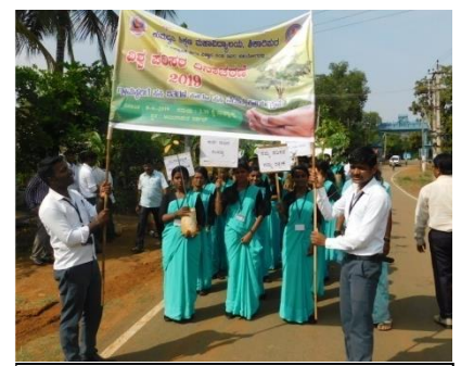
Student Teachers of our college involved in jatha for Environmental Awareness