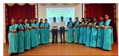
Winners of the competition enjoying by receiving the prizes

On 23rd December 2019, on eve of National Mathematics day science club members of our college organised a creative way of reciting the mathematical table by way of chorus dance. The science club members were segregated in to five groups, and inter competition among the groups was conducted for the best way of presentation of table recitation. Based on the nature of presentation like chorus in dance, symmetry of recitation and fluency of recitation prizes were awarded. All the participants involved actively as well as enthusiastically in the programme.