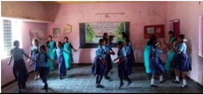
Science club members involved in table recitation along with students