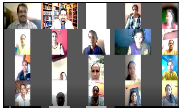
Student Teachers and Staff participated in the online lecturing session

On the eve of World mental health Day On 10th October 2020, the Science Club members of Kumadvathi College of Education has organized online special Lecturing programme on the topic “ Mental Health in The Period of COVID-19 Pandemic ” for our student Teachers through zoom platform.