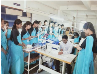
Student teachers involved in preparing the eco - friendly cloth bags