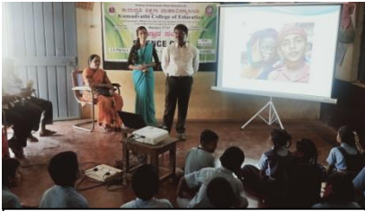
Leprosy awareness programme in GHPS, Thimlapura