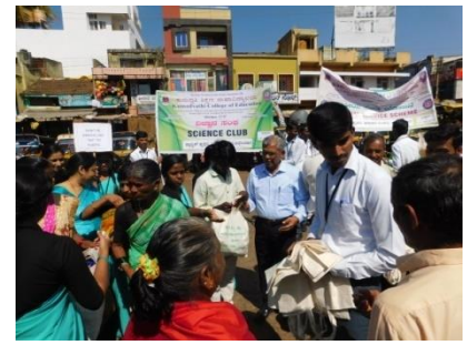
Student teachers involved in developing awareness among publics by providing eco-friendly cloth bags