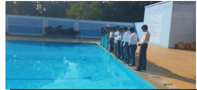
Faculty members observing the solar eclipse

On 26th December 2019 on eve of solar eclipse, mentor teachers of science club planned to show the solar eclipse for the student teachers. All student teachers were taken to the pond as well swimming pool to show solar eclipse in the reflection on the water surface. Student teacher developed the concept behind the occurrence of solar eclipse in nature.