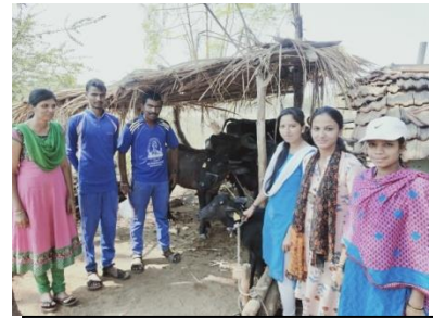
Student teachers in the cattle rearing shed