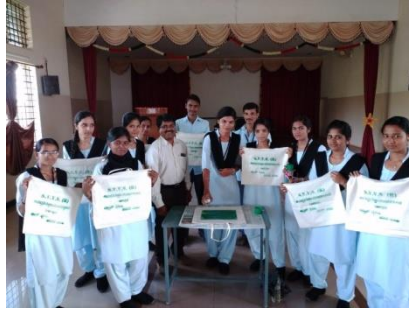
Student teachers with prepared eco - friendly cloth bags