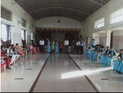
Science Club members sharing their opinion