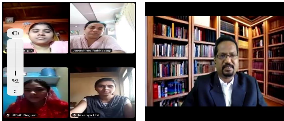
Principal, faculty Members and Student Teachers involved in online prestation session