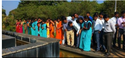
Mentors of Science Club showing solar eclipse on the water surface