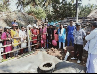
Farmer giving information Gobar gas plant maintenance