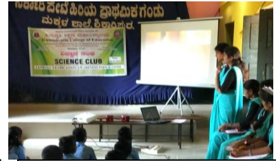
Leprosy awareness programme in Govt. Boys HPS, Shikaripura

On 6th February 2020 on eve of World Leprosy day our Science club members involved in developing awareness among the students of various internship schools. Under the guidance of science club mentors, our Science club members prepared well for delivering special lecture on eradication of Leprosy by power point presentation with related images and videos. In all the internship schools students and teachers actively participated in the programme. The teachers of schools urged our science club members to conduct many number of meaningful and scientific attitude development programmes of this nature in coming days.