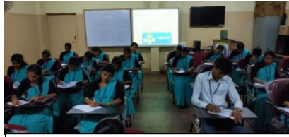
Essay writing by the Student Teachers