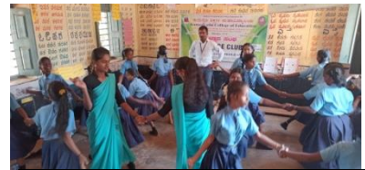
Science club members involved in table recitation along with students

As a part of extension activity under science club on 6th February 2020 our Science club members involved in developing interest among the students of various internship schools by a way of reciting tables in a creative manner.