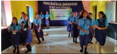
Science club members involved in table recitation along with students