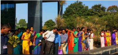
Mentors and student teachers observing the solar eclipse