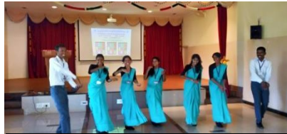
Science Club members involved in the table recitation competition