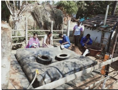
Student teachers observing the gobar gas plant