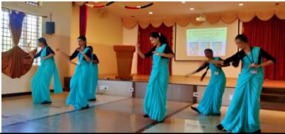
Science Club members involved in the table recitation competition