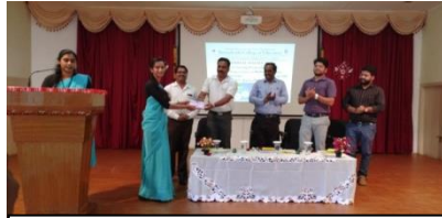
Essay competition winners receiving the prizes