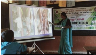
Leprosy awareness programme in GHPS, Ward No. 4, Shikaripura