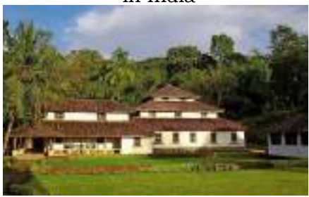
Kuppalli -110 Kms Birthplace and childhood home of Rashtrakavi Kuvempu