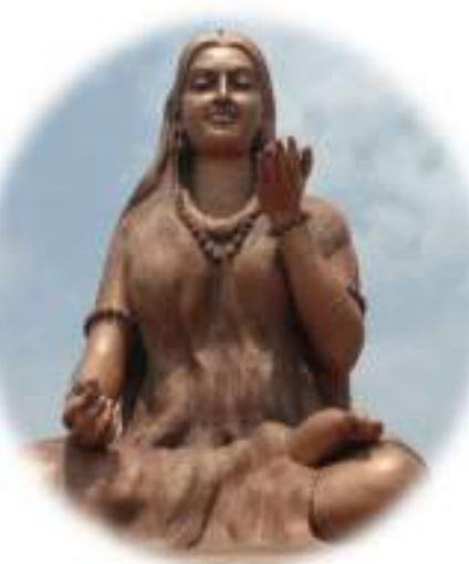
Udugani -18 Kms Birthplace of Akkamahadevi